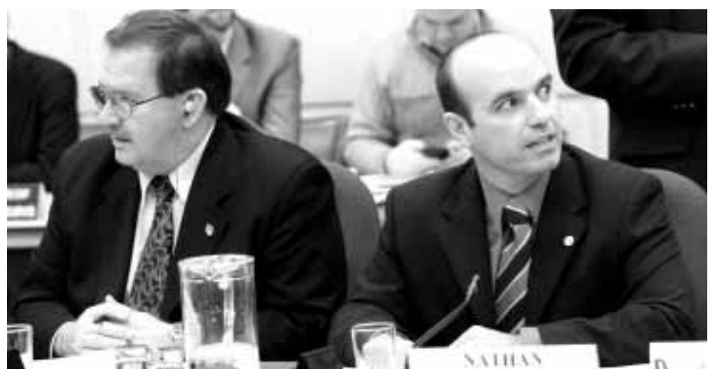
It's the environment stupid: The environment is set to be a top priority when the House resumes Oct. 16. Clockwise from top: Environment Minister John Baird pictured with Green Party Leader Elizabeth May. NDP House Leader Libby Davies, Liberal environment critic David McGuinty and NDP MP Nathan Cullen, pictured with BQ MP Marcel Lussier, say the government's Clean Air Act, Bill C-30, should be revived on the Order Paper. Government House Leader Peter Van Loan says it won't be, however. Stay tuned for a potential showdown on the environment in the House.